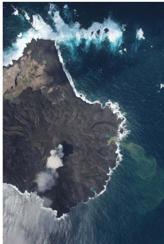
Example of aerial photographs.